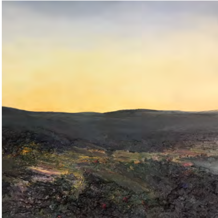
"Eventide" by Dganit Zauberman